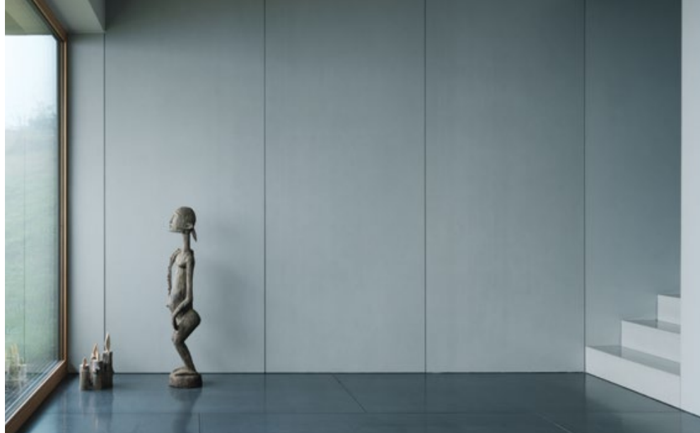
concrete skin for interior design